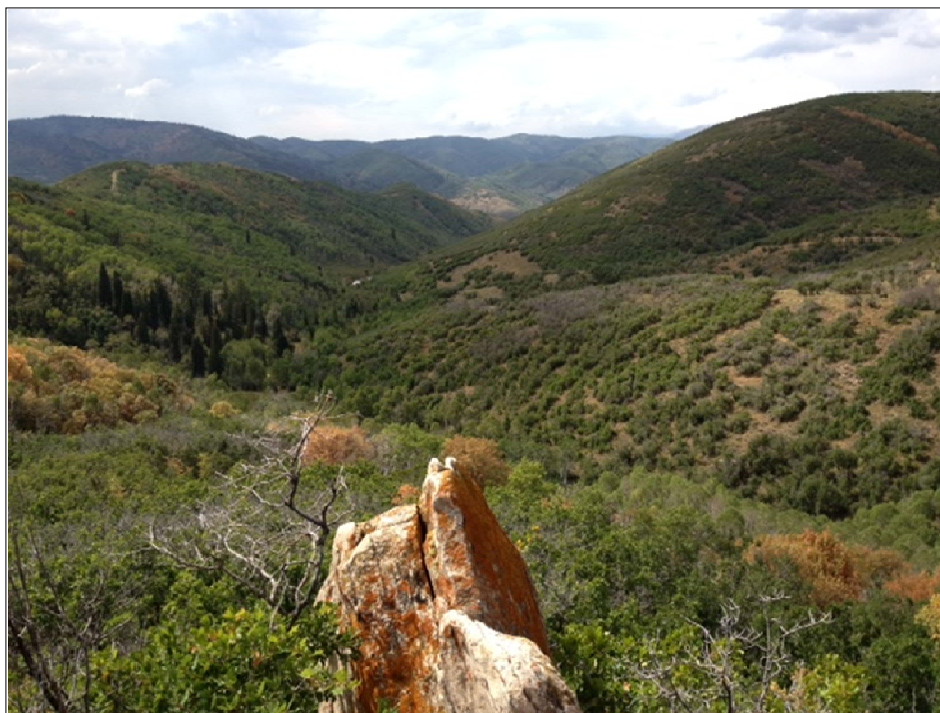
A View To The West From Flying Dog Trail.