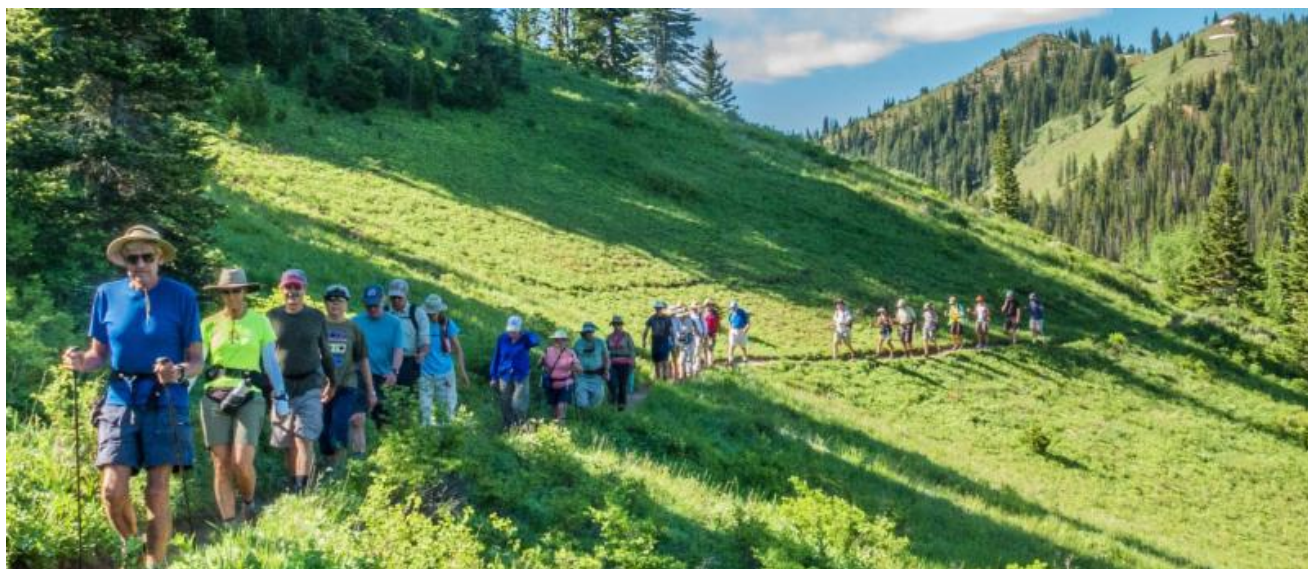
Great Western Trail; Photo by Jon Scarlet